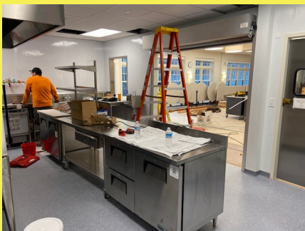
Council on Aging Kitchen