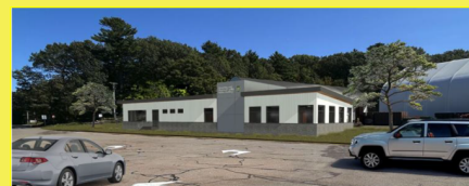
RDF Administration Building

Construction has started on a new administration building for the Recycling and Disposal Facility