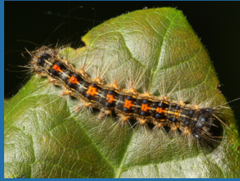
Gypsy moth caterpillar

Learn more about Morses Pond management.