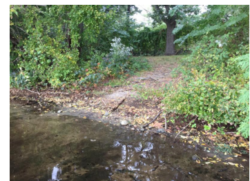
One of 11 erosion sites identified at Morses Pond

The NRC is reviewing recommendations from independent contractor Horsely Witten Group for restoring parts of the Morses Pond shoreline threatened by erosion. Options include buffer plantings and improvements to trails and access at 11 sites accessible to the public.