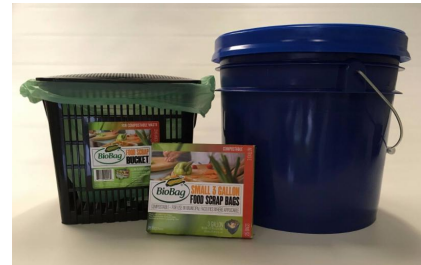
Starter kit for food waste pilot

More families can now sign up for Wellesley's food waste drop off program . The RDF has extended the program through the spring and is inviting 300 more participants to join. Sign up now and get your starter kit, including a countertop basket, compostable bags, and bucket to transport food waste. Participants drop off filled bags at the RDF, then the food waste is taken to an anaerobic digester, turned into a slurry, and converted into energy. Since the pilot began in November, more than 10 tons of food waste has been diverted from the RDF, resulting in the generation of 3,000 kwh of electricity.