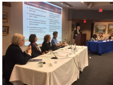
The Selectmen presided as experts outlined the problem and potential solutions.