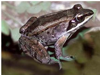
Springtime brings wood frogs back to local vernal pools.