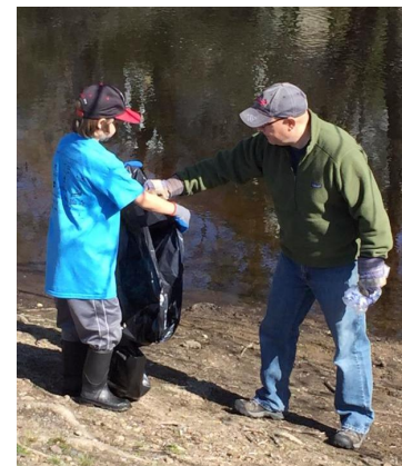
Volunteers collect trash from the riverbank at last year's Charles River Cleanup.

April 2017 is "Keep Massachusetts Beautiful Month!" You can do your part on Saturday, April 29, from 9 am to 12:00 pm , by joining the NRC for the annual Earth Day Charles River Cleanup , sponsored by the Charles River Watershed Association. Each year more than 3,000 local volunteers from Wellesley and neighboring communities pitch in to protect the river we love. Bring your family and friends, pick up litter and enjoy a day on the water. Clean up supplies, snacks and t-shirts are provided by the NRC.