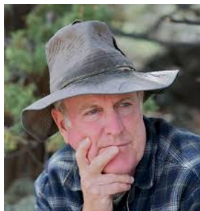
Doug Tallamy to speak on transforming your garden with native plants on May 13!