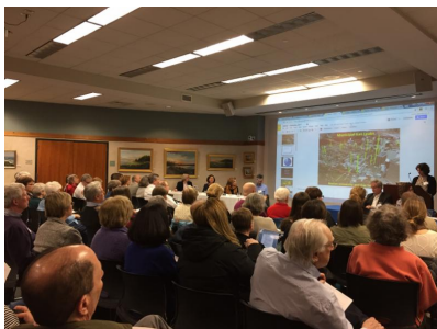
Packed house for the public forum on gas leaks on March 21.

Click here for the slides shown at the March 21 the forum