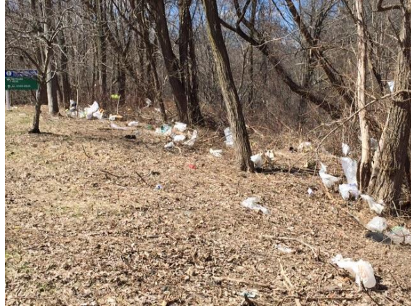
Plastic bags litter the wetlands and woods surrounding the Wellesley Recycling and Disposal Facility.

Please visit the NRC web site for more information about the proposal to limit plastic bags.