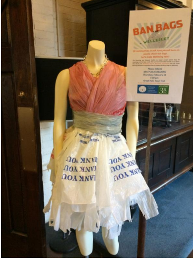
"Reese Cycle" promotes the NRC public hearing at Town Hall on February 11 at 7:30 pm.