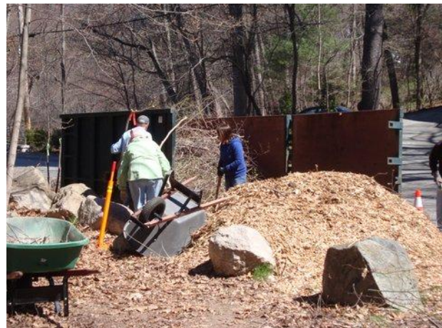
Industrious volunteers pitched in to help clean up Reeds Pond, near Woodside Avenue.

In 2016, we'll be working on these projects (and more!):