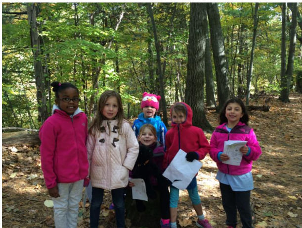
Daisy Troop 69053 enjoys the scavenger hunt at the annual Kids Trails Day, hosted by the Trails Committee in the Town Forest.