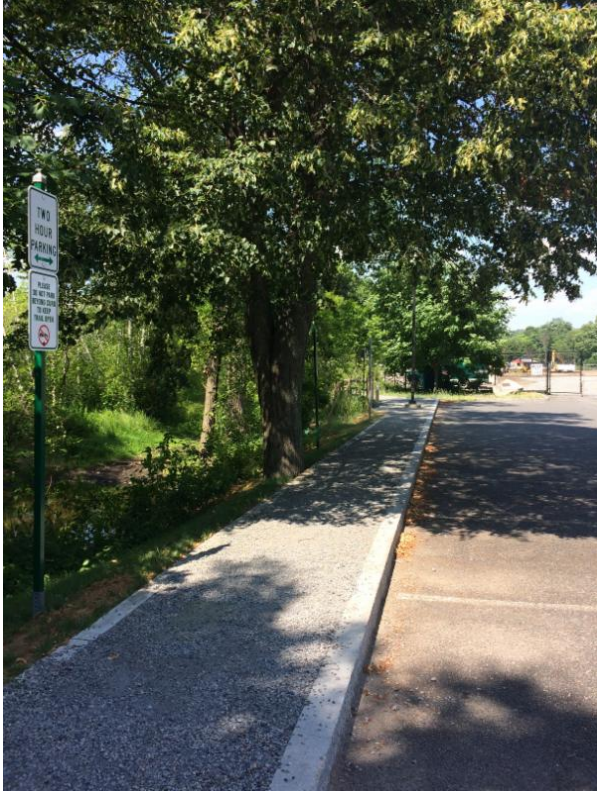
Pedestrian trail along Smith Street parking lot.