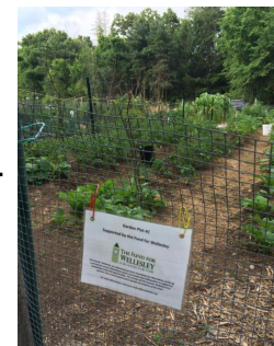
4C garden plot.

The Women's Lunch Place , a women's day shelter in Boston, also received a sweet donation - fresh-grown rhubarb which the chefs used to make strawberry rhubarb pie for residents and shared in this Facebook post.