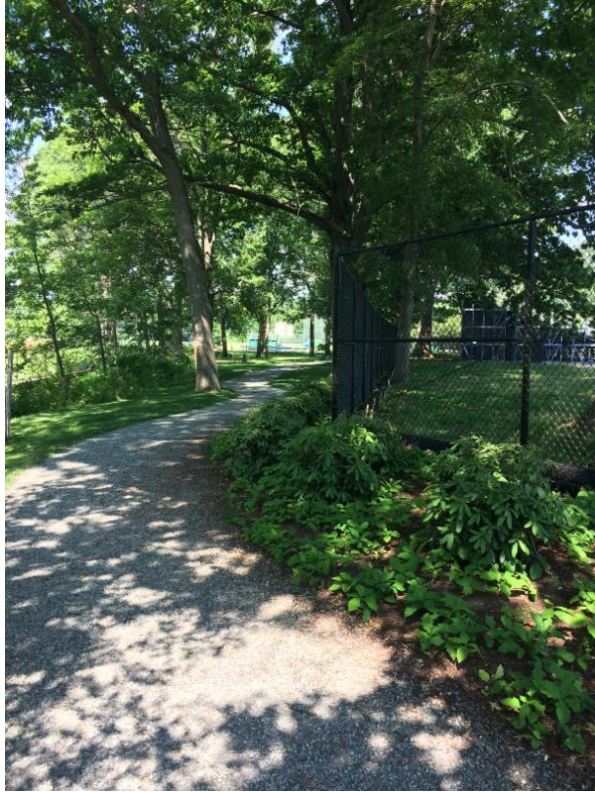
Pathway behind athletic stadium.