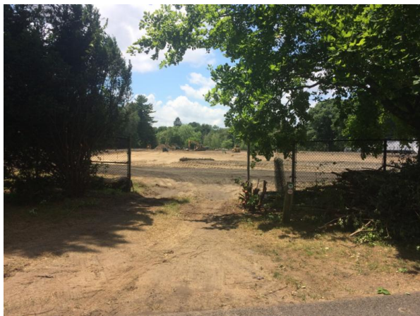
Opening marking the area where entrance to new athletic stadium will be built.