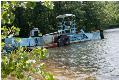
Weed harvester at work in the pond.

Maintenance at Morses Pond doesn't cool off during the summer months. The NRC is continuing its work to improve the water quality and maintain the banks of the pond, which is a favorite spot for swimmers, boaters and outdoor enthusiasts.