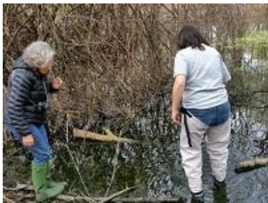
Looking for woodfrogs and salamander eggs in vernal pools.