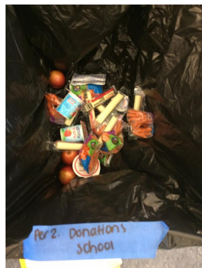
Unopened food donated to the Wellesley Food Pantry.