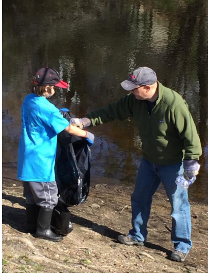
Charles River Earth Day clean up.