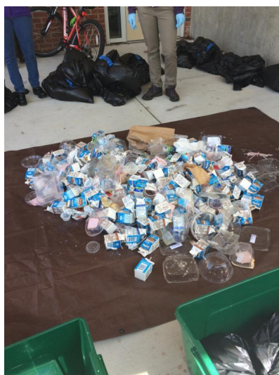
One days' worth of recycling.