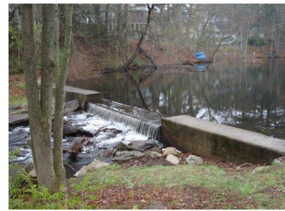
Reeds Pond spillway after clean up.