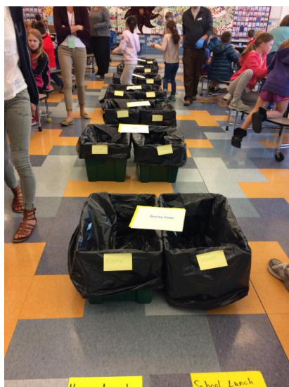
Food was sorted into different categories.

During the past few weeks, students have been sorting food into seven different categories according to the EPA Food Recovery Hierarchy , in order to measure the amount of food that can be reduced, donated to feed hungry people, feed animals, reused (e.g. composting), recycled or is trash. This information will be used to develop a set of goals for the school in the coming year.