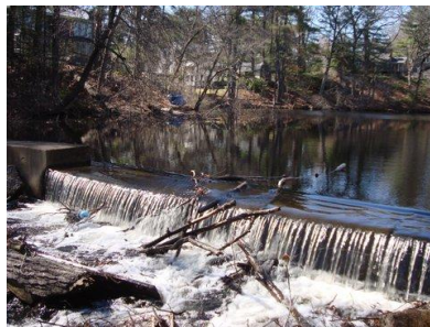
Reeds Pond spillway with debris.