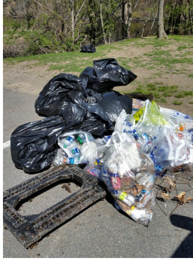
Trash and debris from the Charles River.