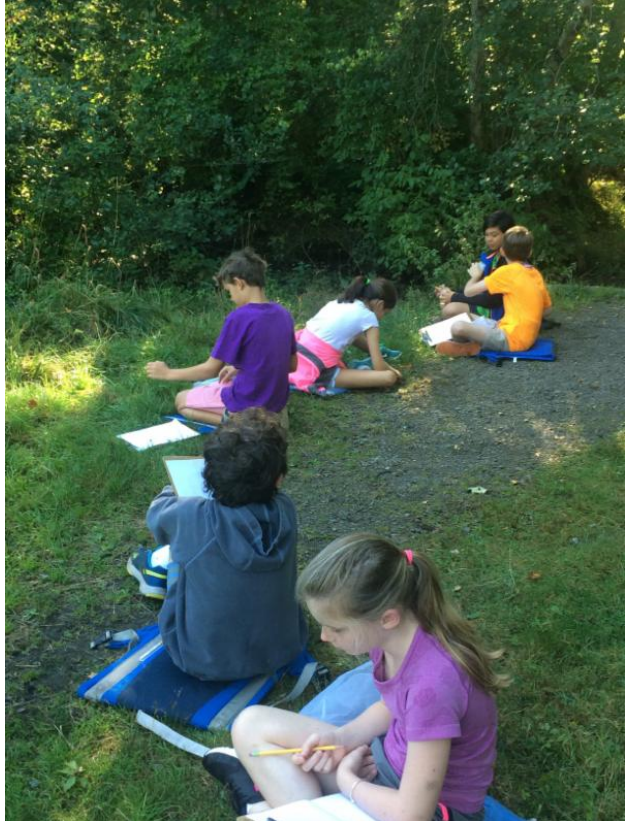
Introducing the outdoor classroom idea to students. Students making observations in the "grassroom"