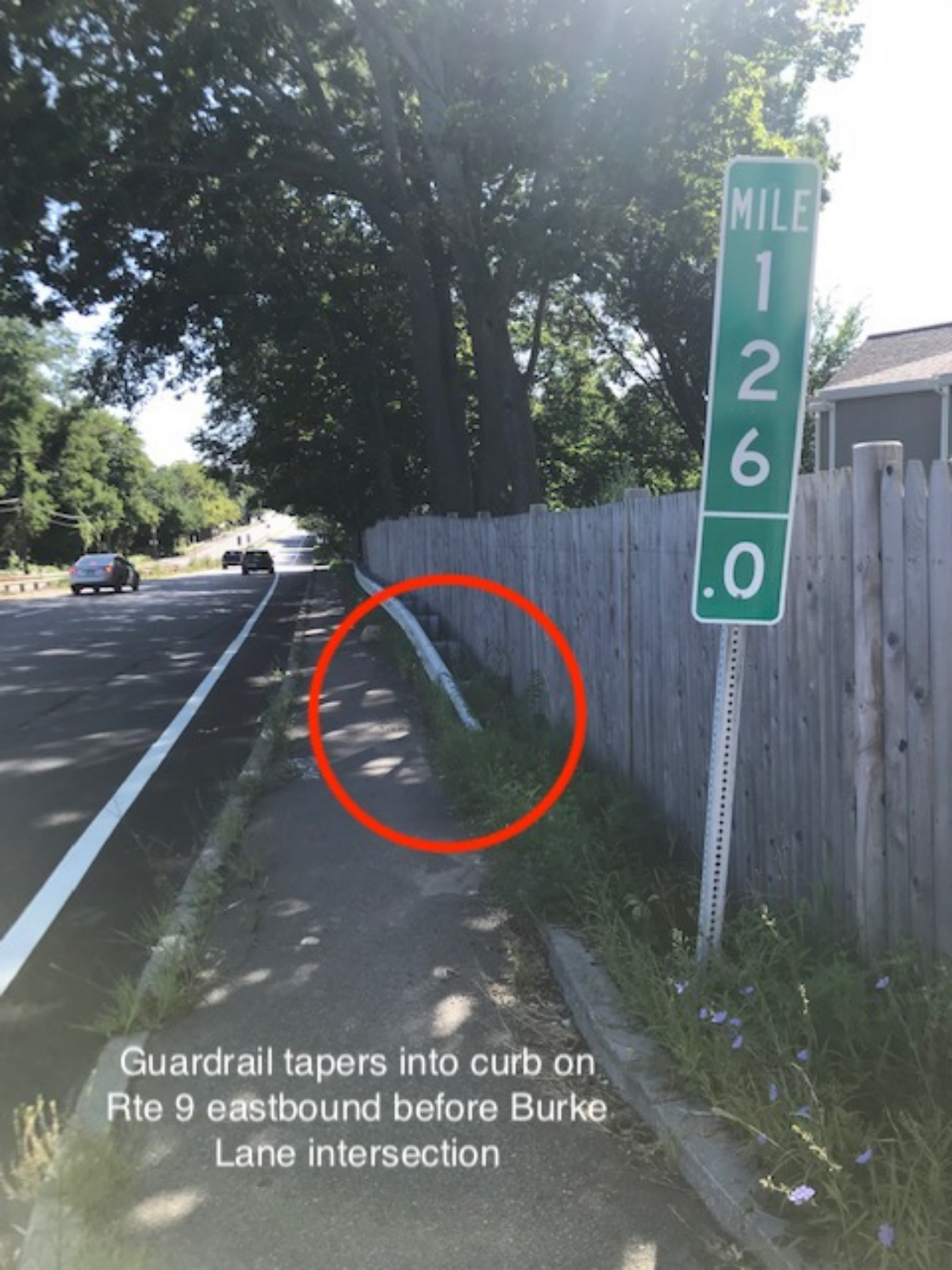
Guardrail tapers into curb on Rte 9 eastbound before Burke Lane intersection