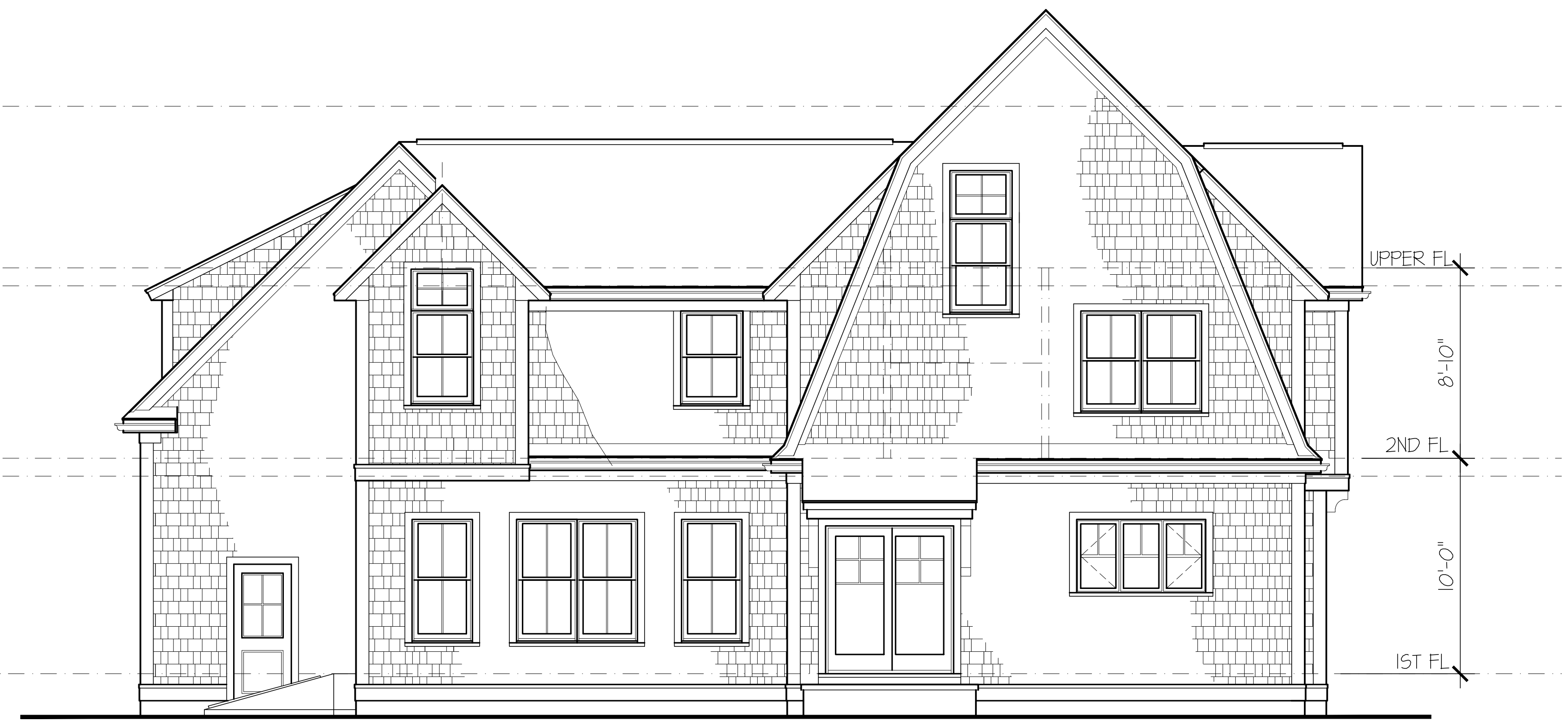
A REAR ELEVATION 1/4" = 1'