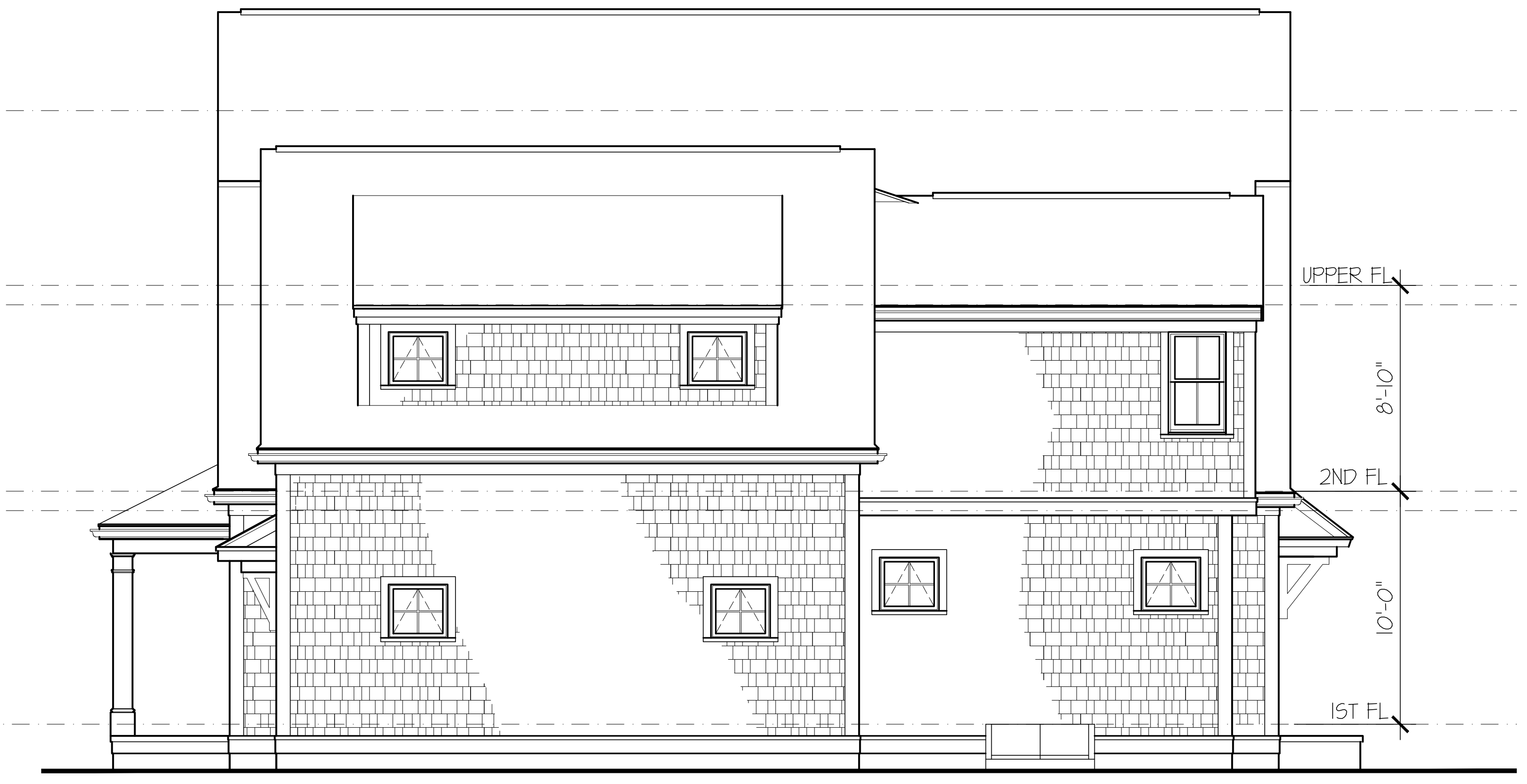
B RIGHT SIDE ELEVATION 1/4" = 1'