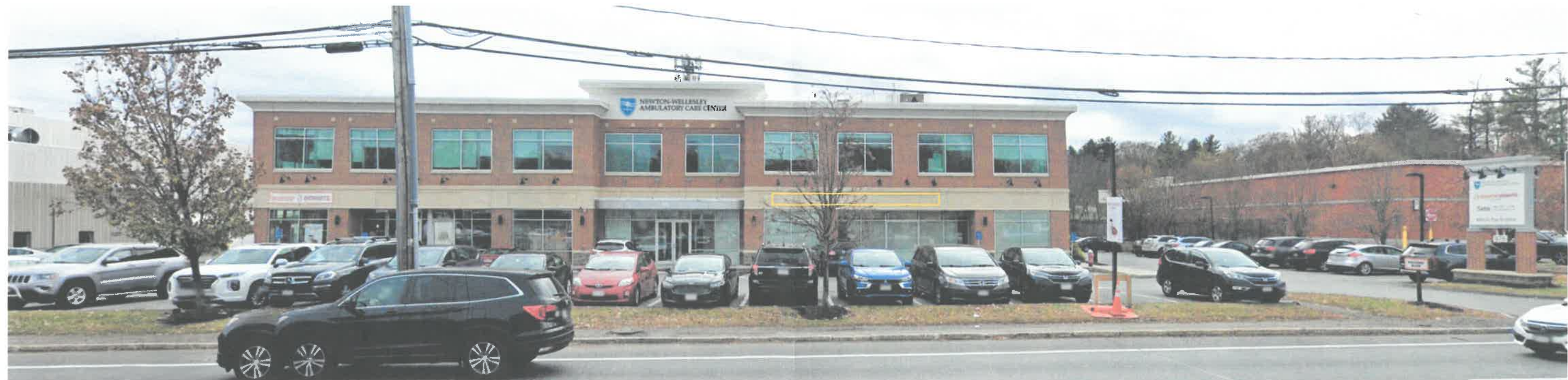
Street view image, for reference

Size: 2'-6" x 30'-0" Total Area: 75 SF Printed vinyl/fabric, mounted with grommets and removable fasteners