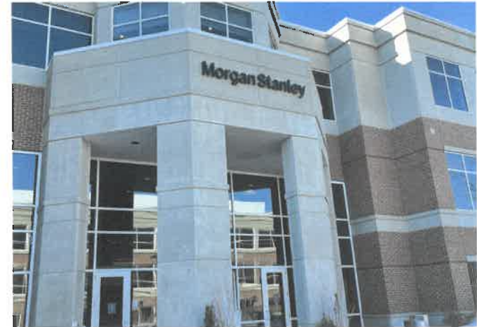
112 Worcester St Exterior Signage; Morgan Stanley