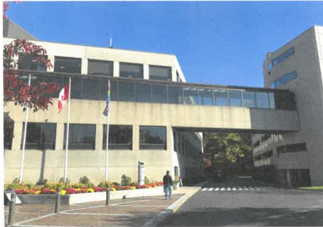
Inside Campus; Sign visible to employees and visitors only