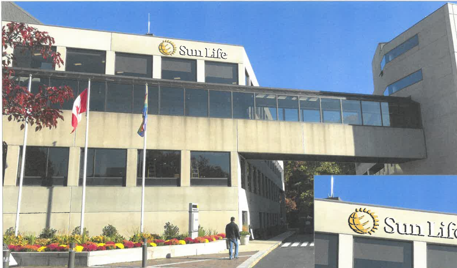
Proposed signage size: 191.5"w x 45.5"h. Aluminum/steel support structure will be painted for best surface match and provide transparency to building surface.