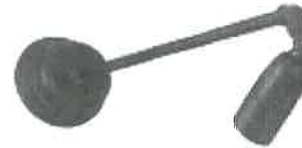
DETAIL VIEW OF ACTUAL LAMP STYLE PAR 16 LAMP PER FIXTURE