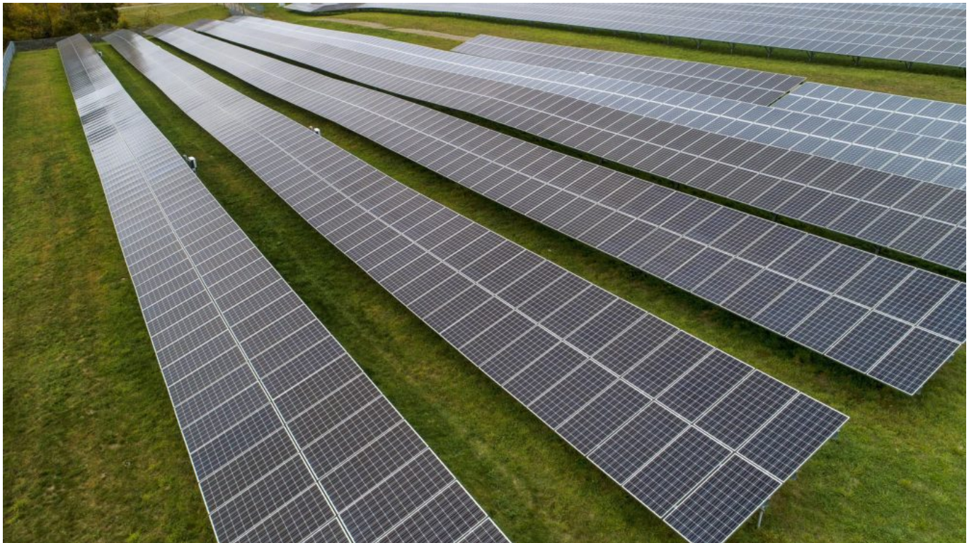
Solar panels in a field at Knowlton Farm, Grafton, Mass.

Finally, the law directs the Department of Elementary and Secondary Education to help schools across the state establish pilot programs for offshore wind job training. As part of this work, the department needs to track the number of low-income, English-language learners and students with disabilities who complete a certificate program.